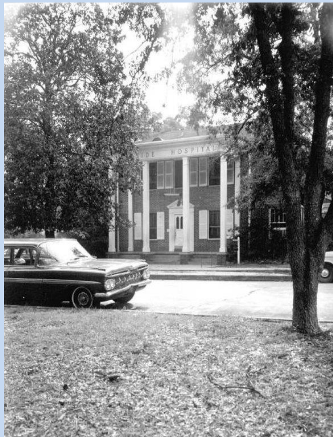
Florida Chautauqua Lakeside building as it appeared when it was Lakeside Hospital.

In 2013 the Florida Chautauqua began took a step to solidifying its place in DeFuniak Springs. With the aquisition of the old Lakeside Hospital building to use as our headquarters. This historic building was the perfect choice for the association because of its location, space, and functional possibilities. The Association has worked to preserve and repair the ravages of time on the building. Opened